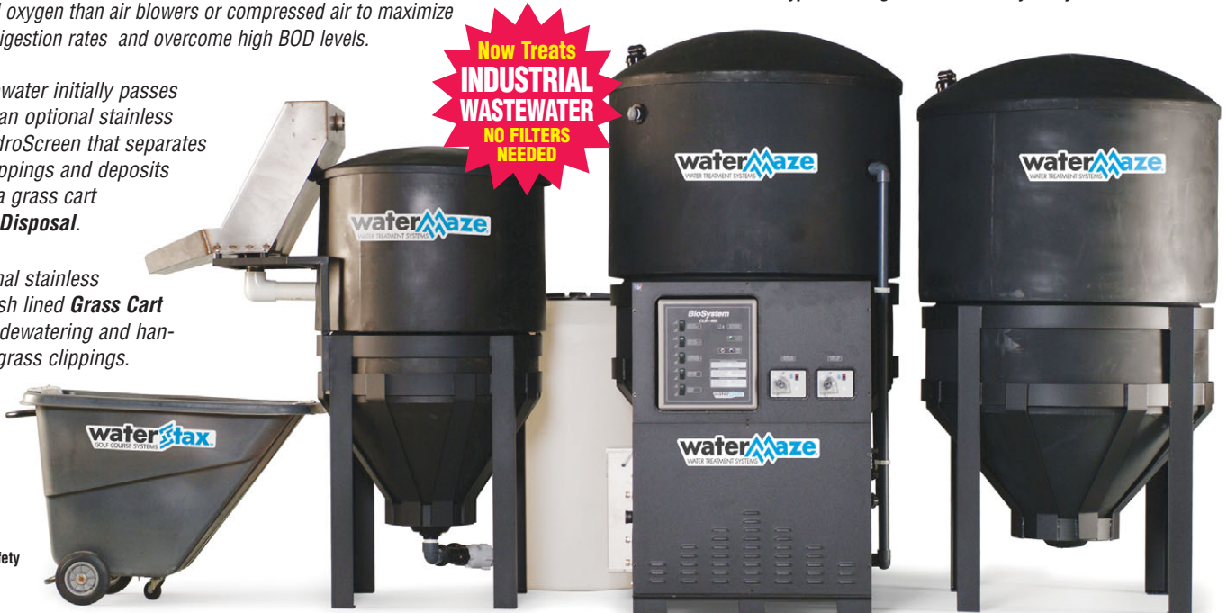
Optional cart for easy disposal of grass clippings