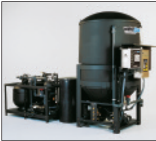
■ CL-603 with Filter Pac III Recycle System

Flow Rates of up to 30 GPM | Compact Footprint | Self-Contained Yet Modular Flexibility | Above Ground Design