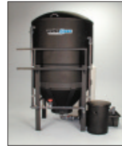
■ CL-30 Pre-Treatment Solids Separator