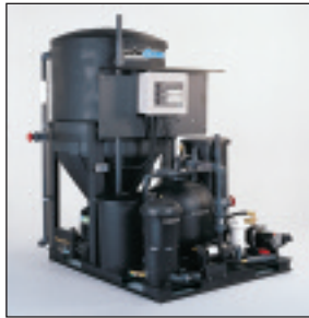
■ CL-304 Extra-Compact Recycle System