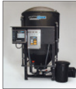
■ CL-600 Discharge System